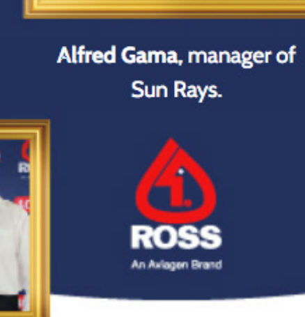
Festive's new 400 Club members